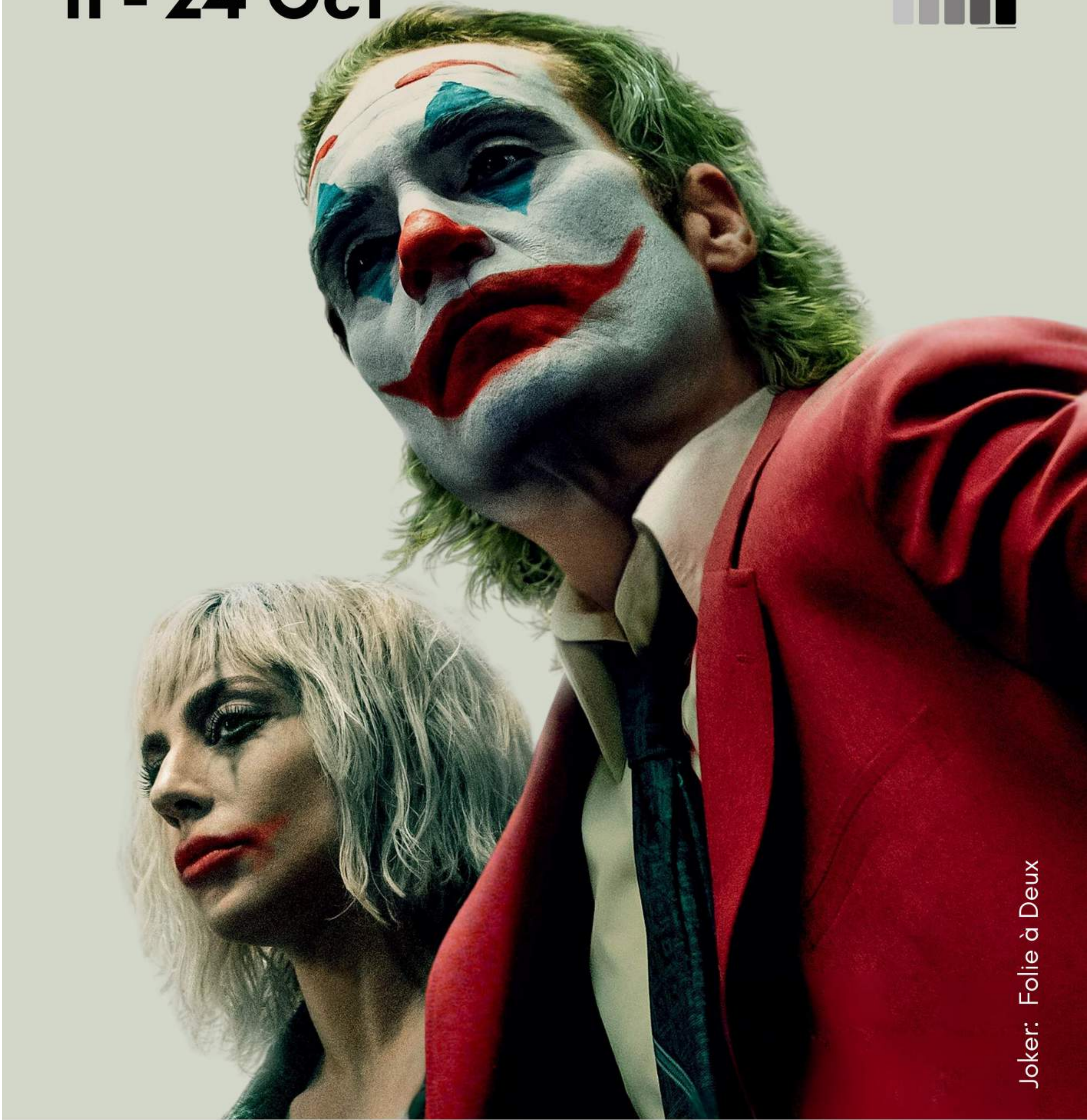
Joker: Folie à Deux

Please visit our website HBPH.CO.UK for trailers, ticket information and bookings. To join our free mailing lists scan the QR code. Thank you for supporting our not-for-profit cinema!