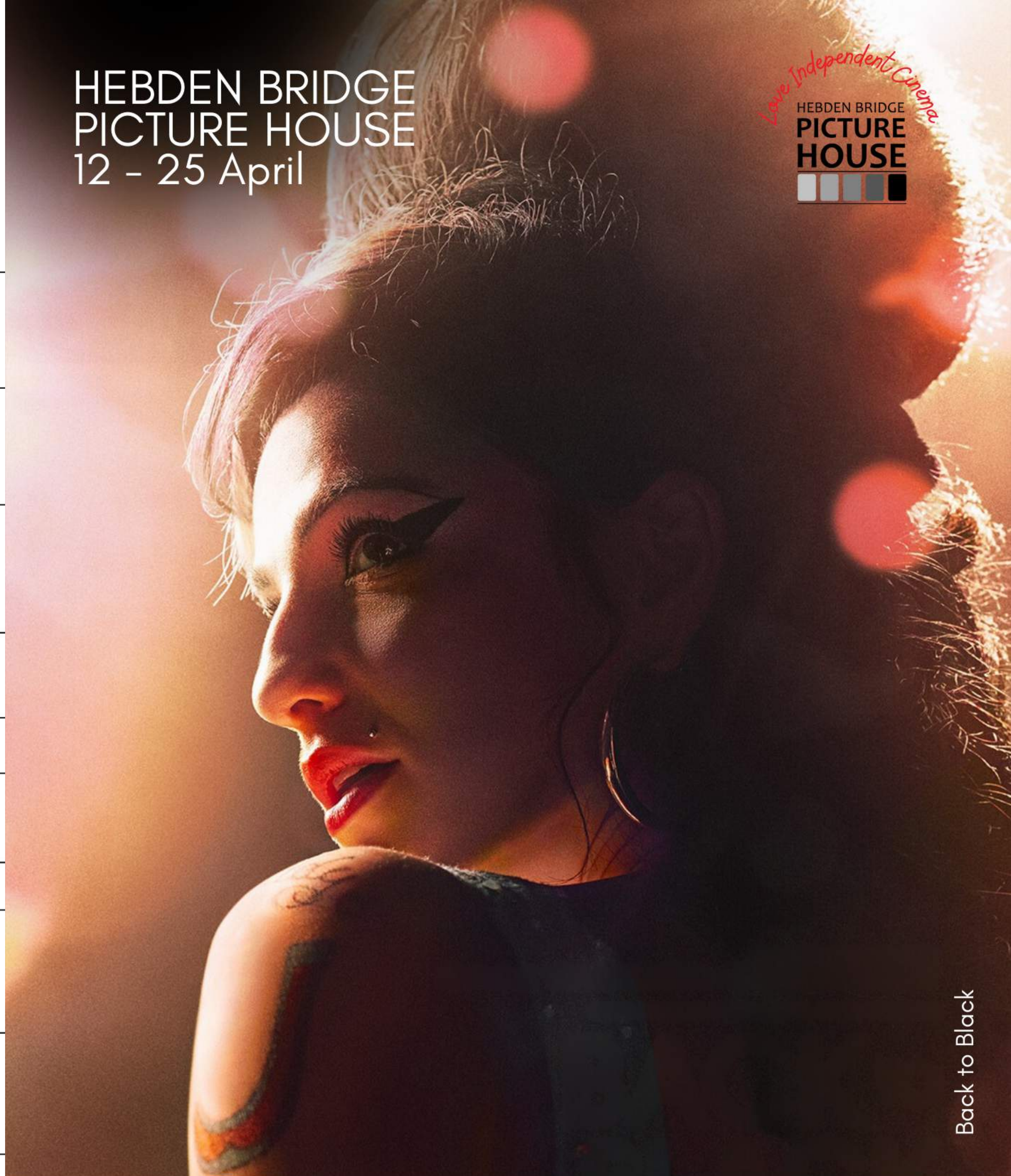
Back to Black

Lights, Camera, Screen Two is a project which explores the opportunity to add a second screen at Hebden Bridge Picture House. Your feedback is vital! Please scan the QR code to complete our survey.