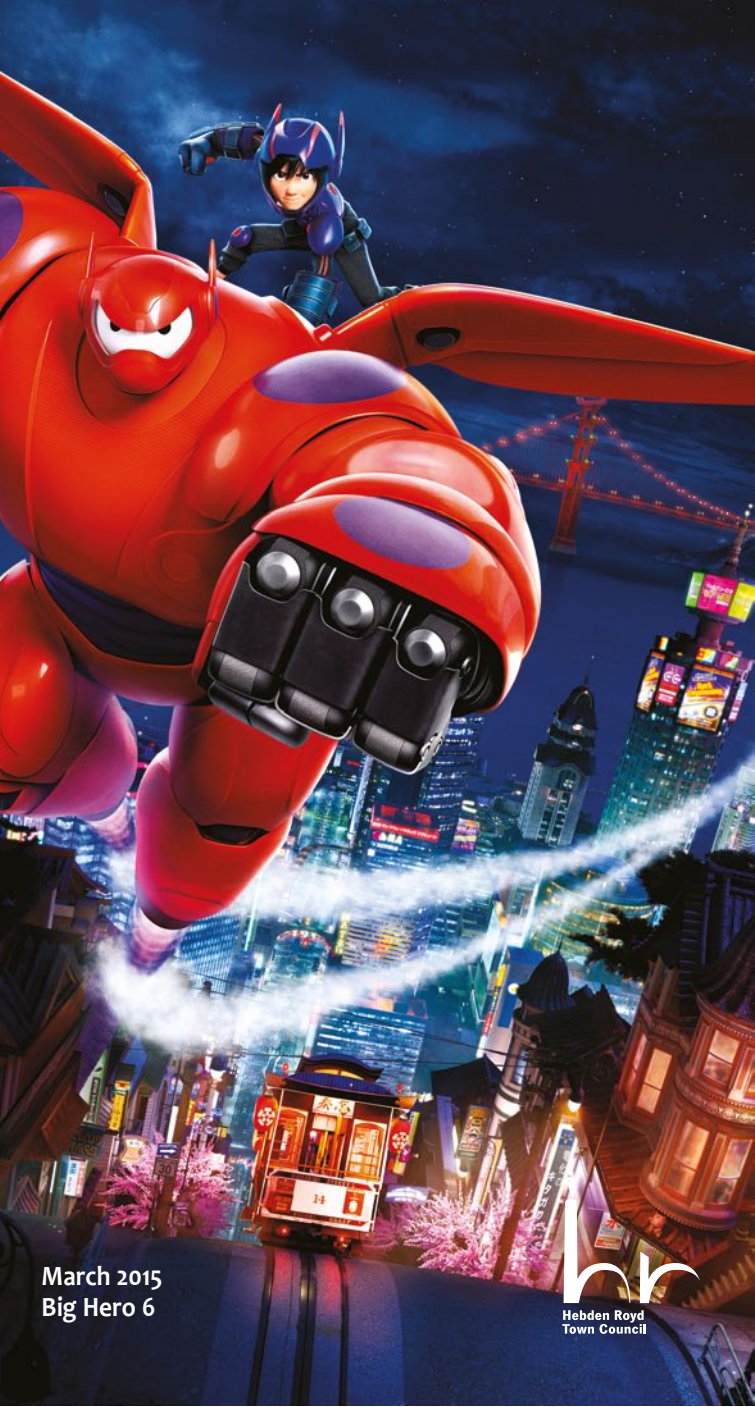
March 2015 Big Hero 6

With the lights turned up a little (and the sound down a notch or two), we help to create a stress-free environment exclusively for parents and guardians to enjoy films with their babies.